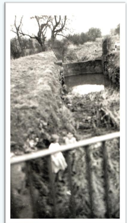
Health and safety? What health and safety? Children play in Asfordby Mill lock