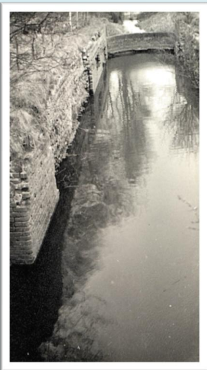
Washstones Ford Lock

We have all seen this view of the old Melton Basin before, but compare it with Les's view shot in 1968.